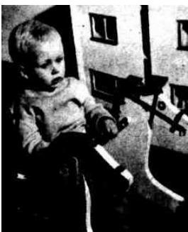
The baby of the Home

Description: This is a copy of an image published in The Argus on Saturday 6 August 1938. The image shows children hanging upside down on exercise bars. The original captions read: 'Everything is upside down to these children at the Sutherland Homes, Greensborough. They keep warm with their exercises on the parallel bars.'