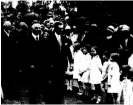
Sutherland Homes for Children