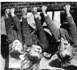
Happy Children at Play