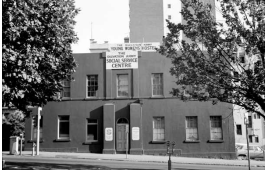
Spring Street West between Little Bourke Street and Lonsdale Street, Melbourne

Description: Looking across street towards double storey building, signs at roof read: The Salvation Army Young Women's Hostel / Salvation Army Social Service Centre.