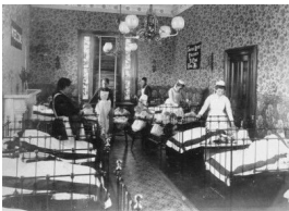
The Haven Maternity Home, Melbourne