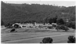
The Salvation Army Boys' Home, The Basin, Vic.