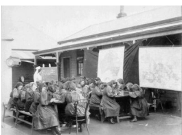
Girls Home, Brunswick, Victoria