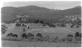
Salvation Army Home near Boronia, Vic.

Description: "Blackhall", built ca. 1890. Acquired by the Salvation Army in 1915 and renamed Catherine Booth Girls' Home.