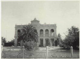
Salvation Army Girls' Home, Sackville Street, Kew

Description: Looking across street towards double storey building, signs at roof read: The Salvation Army Young Women's Hostel / Salvation Army Social Service Centre.