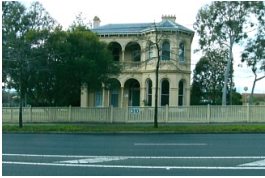
Box Hill Boys' Home