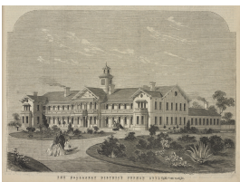
The Ballarat District Orphan Asylum