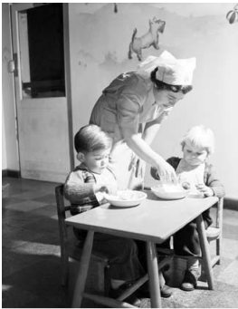
Berry Street Foundling Hospital, Melbourne - toddlers having their dinner