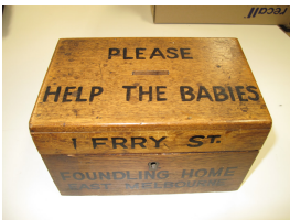
Berry Street Foundling Home, East Melbourne, Donation Box

Description: This is a photograph of the Berry Street Foundling Home donation box, with "Please, Help the Babies" written on the lid.