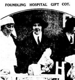
Foundling Hospital Gift Cot

Description: This is a photograph of the Berry Street Foundling Home donation box, with "Please, Help the Babies" written on the lid.