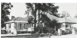
Family Group Home, Lalwa St., Blackburn

Description: This photograph was published in the Kildonan Children's Home Annual Report, 1961. It shows the front of a brick cottage, with a lawn and low brick fence in front. The description published alongside the photograph reads "Family Group Home, Main St., Blackburn - three bedrooms are being added, a 30ft. X 45 ft. garage gives much-needed storage space".