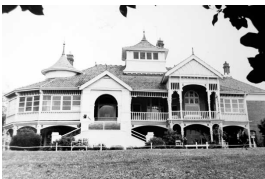
St Cuthbert's in Colac