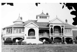
St Cuthbert's in Colac