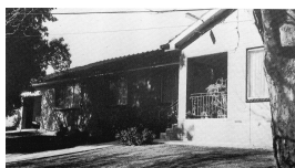
Colac Family Group Home