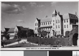
St Aidan's Orphanage, Bendigo