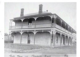
Girls Home - Riddell's Creek - Vic.