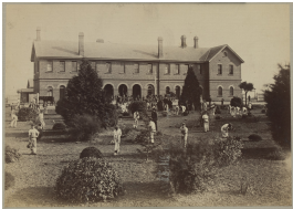
Boys' Reformatory, Ballarat