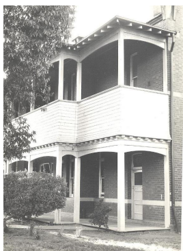
Elizabeth Fry Retreat

Description: Photocopy of a programme to mark the opening of the Elizabeth Fry Retreat [pictured] in Argo Street, South Yarra in 1914.