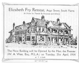
Elizabeth Fry Retreat, Argo Street, South Yarra

Description: Photograph of Elizabeth Fry Retreat (later Swinborn Lodge), South Yarra, viewed from the street.