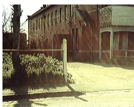
Elizabeth Fry Retreat (later Swinborn Lodge), South Yarra