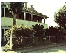
Elizabeth Fry Retreat (later Swinborn Lodge), South Yarra

Description: Photograph of Elizabeth Fry Retreat (later Swinborn Lodge), South Yarra, viewed from the street.