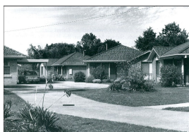
Attractive flats for homeless young people [editor's note: this is the original caption]

Description: This is a copy of a photograph published in 'One Thousand White Onions': a history of caring for children since 1865 on p.174.