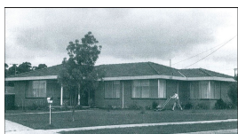
A family group home at Karingal, later sold

Description: This is a copy of a photograph published in 'One Thousand White Onions': a history of caring for children since 1865 on p.149.