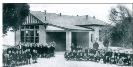
School No.4136 in the grounds of the Home staffed by members of the Education Department

Description: This is a copy of a photograph published in 'One Thousand White Onions': a history of caring for children since 1865 on p.147.