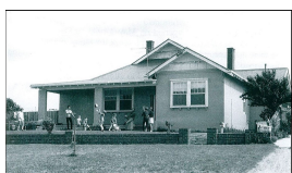
Children at play at Williams Street

Description: This is a copy of a photograph published in 'One Thousand White Onions': a history of caring for children since 1865 on p.190.