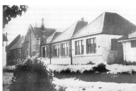
The Home on the Hill at the top of Olivers Hill

Description: This is a copy of a photograph published in 'One Thousand White Onions': a history of caring for children since 1865 on p.114.