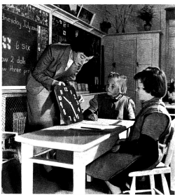
Pleasant Creek Special School

Description: This image appeared in the Department of Mental Hygiene's annual report for 1953.