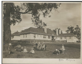
The Kindergarten Holiday Home, Forest Hill, Vic.

Description: This is one of six images from the collection of the State Library of Victoria showing the Forest Hill Kindergarten Holiday Home. It would appear to show the new building, constructed in 1936 and officially opened in 1937.