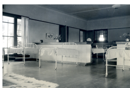
Forest Hill Residential Kindergarten - Nursery, c.1938

Description: This is one of six images from the collection of the State Library of Victoria showing the Forest Hill Kindergarten Holiday Home. It would appear to show the new building, constructed in 1936 and officially opened in 1937.