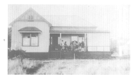
The original holiday home

Description: This is a copy of a photograph from the collection of the Whitehorse Historical Society, showing the nursery at Forest Hill Residential Kindergarten.