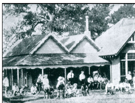
Holcombe at Frankston was purchased in 1922

Description: This is a copy of a photograph published in 'One Thousand White Onions': a history of caring for children since 1865 on p.36.