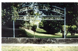
North Coast Children's Home

Description: This photo is undated, the date included is an estimate.