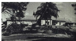
"The home" [North Coast Children's Home]

Description: This photo is undated, the date included is an estimate.