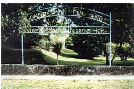
North Coast Children's Home

Description: This photo is undated, the date included is an estimate.