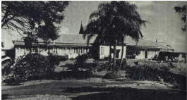
"The home" [North Coast Children's Home]

Description: This photo is undated, the date included is an estimate.