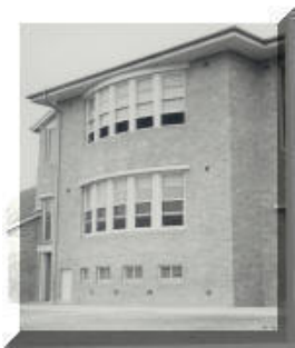
Dining Room and Dormitory (Monte Pio)

Description: This image shows the building and grounds of the Bishop Murray Memorial Home.