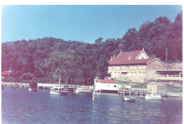
Image of St Catherine's Orphanage Brooklyn, viewed from the water

Description: This is a copy of an image from the Sisters of Mercy, North Sydney Congregation archives collection. The image shows the Brooklyn Hotel in the 1890s, which later became St Carthage's College for Young Ladies and St Catherine's Orphanage.