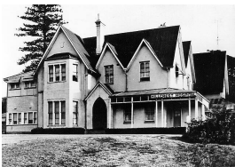
Hill Crest Hospital, Merewether, formerly The Ridge

Description: The image shows the building where Maryville Mothers' Hospital and later Hillcrest Mothers' Hospital was located.