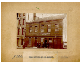
First offices of the Society

Description: This photograph is of a Sydney Rescue Work Society office and is from papers held by Integricare. This photo is undated, the date included is an estimate.