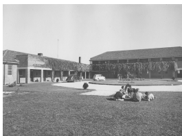
Berry Training Farm - the house

Description: This is a digital copy of a photograph from an album collected by Child Welfare Department officers in the late 1940s.