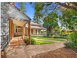
Brougham from the side

Description: This image was included on a real estate listing of the building that Brougham had previously operated in.