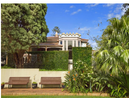
Brougham, from the rear

Description: This image was included on a real estate listing of the building that Brougham had previously operated in.