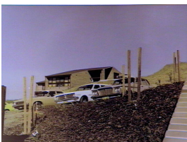
Minister Opens Keelong Remand Centre Unanderra

Description: This image shows the outside of the Keelong Remand Centre.