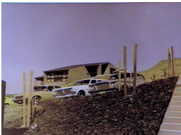
Minister Opens Keelong Remand Centre Unanderra

Description: This image shows the outside of the Keelong Remand Centre.