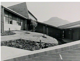
Minister Opens Keelong Remand Centre Unanderra

Description: This image shows the outside of the Keelong Remand Centre.