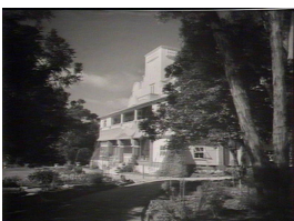
State home, Weroona, at Woodford, Blue Mountains