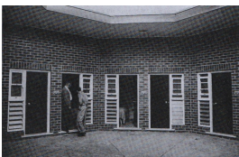
"Worimi" - rooms for inmates. There are boy boys and girls at "Worimi" [original caption]

Description: This is a copy of an image that appeared in the Child Welfare Department of New South Wales Annual Report of 1966.