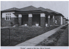
"Worimi" - opened on 30th June, 1966 at Newcastle

Description: This series of pictures is captioned as being of the Worimi Centre at Wollongong, but there has never been such an organisation. This is thought to refer to the Worimi Centre at Newcastle.