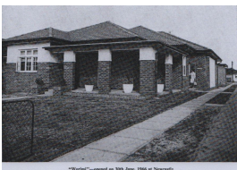
"Worimi" - opened on 30th June, 1966 at Newcastle

Description: This series of pictures is captioned as being of the Worimi Centre at Wollongong, but there has never been such an organisation. This is thought to refer to the Worimi Centre at Newcastle.