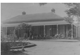
Yasmar - Children's Court and Administration Building

Description: This is a digital copy of a photograph from an album collected by Child Welfare Department officers in the late 1940s.