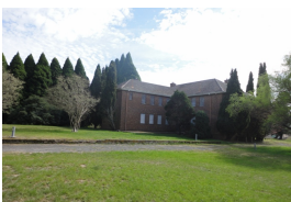
Challoner Cottage viewed from Bong Bong Road

Description: This image shows Mittagong Farm Home, Cottage No.12, Old Dormitory Building, Renwick Child Welfare House, Mittagong Training School for Boys, Renwick Farm Home, Renwick State Ward Home.