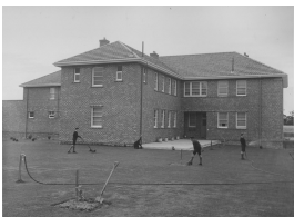
Heffernan [Mittagong Homes]

Description: This is a digital copy of a photograph from an album collected by Child Welfare Department officers in the late 1940s.