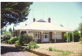
Goodlet Cottage: Mittagong Training Centre Group

Description: This image shows a building that was part of the Mittagong Training School Group.