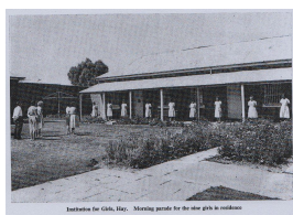
Institution for Girls, Hay. Morning parade for the nine girls in residence.

Description: This is a copy of an image that appeared in the Child Welfare Department of New South Wales Annual Report of 1962.