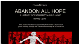
Abandon All Hope - a history of Parramatta Girls Home

Description: This image was included in the National Museum of Australia's Inside blog, originally provided by Community Services New South Wales, Human Services.