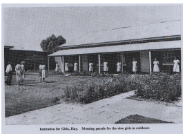
Institution for Girls, Hay. Morning parade for the nine girls in residence.

Description: This is a copy of an image that appeared in the Child Welfare Department of New South Wales Annual Report of 1962.