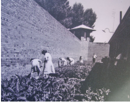
Girls working in the garden, watched over by officers, Hay Institution for Girls, 1965.

Description: This image was included in the National Museum of Australia's Inside blog, originally provided by Community Services New South Wales, Human Services.