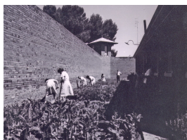
Girls working in the garden, watched over by officers, Hay Institution for Girls, 1965.

Description: This image was included in the National Museum of Australia's Inside blog, originally provided by Community Services New South Wales, Human Services.