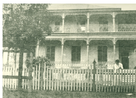
The original Milleewa