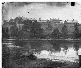
Protestant Orphan School, Parramatta: general view

Description: This is a digital copy of a carte de visite, or postcard, taken from 1870 to 1875. The Female Orphan School, by that stage, was known as the Protestant Orphan School.