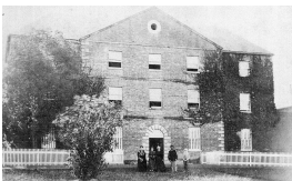
Female Orphan School, Parramatta, 1870-1875, [Protestant Orphan School]

Description: This is a digital copy of a carte de visite, or postcard, taken from 1870 to 1875. The Female Orphan School, by that stage, was known as the Protestant Orphan School.