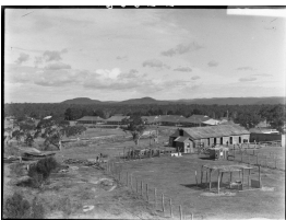
Child Welfare Farm Home for Boys, Gosford - the home

Description: This is a photograph of the boys dormitory at Gosford Training School. It shows three rows of steel-framed beds and bed-side dressers in a long, high-ceilinged hall. It is likely that this dormitory looked similar when the institution became the Mount Penang Training School in 1946.