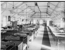
Dormitory: Gosford Boys Home

Description: This is a photograph of the boys dormitory at Gosford Training School. It shows three rows of steel-framed beds and bed-side dressers in a long, high-ceilinged hall. It is likely that this dormitory looked similar when the institution became the Mount Penang Training School in 1946.