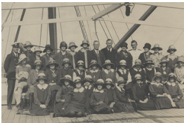
A Day at the Beach: 1928

Description: This is a copy of a photograph in the archives of the School for Deaf Girls, Waratah (formerly known as Waratah Deaf and Dumb Institute) at the Rosary Convent, Waratah, NSW, Australia, held by Cultural Collections at the University of Newcastle, Australia. The image shows a group of pupils and teachers sitting outside on the steps of the School for Deaf Girls.