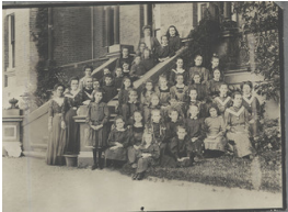
Pupils: Rosary Convent, Waratah, 1908

Description: This is a copy of a photograph in the archives of the School for Deaf Girls, Waratah (formerly known as Waratah Deaf and Dumb Institute) at the Rosary Convent, Waratah, NSW, Australia, held by Cultural Collections at the University of Newcastle, Australia. The image shows a group of pupils and teachers sitting outside on the steps of the School for Deaf Girls.