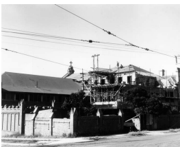
The new Deaf and Dumb School for girls at Waratah

Description: This is a digital copy of an image by Ralph Snowball (1849-1925), held by Newcastle City Council and made by Newcastle Cultural Collections