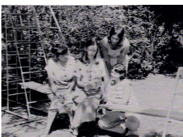
Social workers playing with State wards at Montrose C.L.P.U., Burwood

Description: This is an image of a bedroom at Montrose Child Protection Centre taken in June 1979. Please note that the State Library of New South Wales collection includes more digitised images of Montrose Child Protection Centre taken by the Government Printing Office, including images of the exterior and interiors of the Child Protection Centre, staff, children and parents.