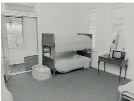
Montrose Child Protection Centre

Description: This is an image of a bedroom at Montrose Child Protection Centre taken in June 1979. Please note that the State Library of New South Wales collection includes more digitised images of Montrose Child Protection Centre taken by the Government Printing Office, including images of the exterior and interiors of the Child Protection Centre, staff, children and parents.