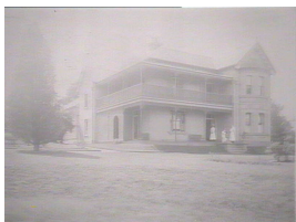
Montrose Maternity Hospital, Burwood

Description: This is an image of a bedroom at Montrose Child Protection Centre taken in June 1979. Please note that the State Library of New South Wales collection includes more digitised images of Montrose Child Protection Centre taken by the Government Printing Office, including images of the exterior and interiors of the Child Protection Centre, staff, children and parents.