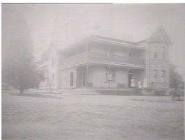
Montrose Maternity Hospital, Burwood

Description: This is an image of a bedroom at Montrose Child Protection Centre taken in June 1979. Please note that the State Library of New South Wales collection includes more digitised images of Montrose Child Protection Centre taken by the Government Printing Office, including images of the exterior and interiors of the Child Protection Centre, staff, children and parents.