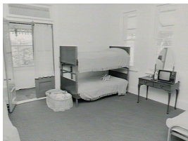
Montrose Child Protection Centre

Description: This is an image of a bedroom at Montrose Child Protection Centre taken in June 1979. Please note that the State Library of New South Wales collection includes more digitised images of Montrose Child Protection Centre taken by the Government Printing Office, including images of the exterior and interiors of the Child Protection Centre, staff, children and parents.