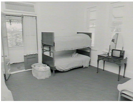
Montrose Child Protection Centre

Description: This is an image of a bedroom at Montrose Child Protection Centre taken in June 1979. Please note that the State Library of New South Wales collection includes more digitised images of Montrose Child Protection Centre taken by the Government Printing Office, including images of the exterior and interiors of the Child Protection Centre, staff, children and parents.