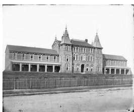
Deaf, Dumb & Blind Institute, before extensive renovation and addition, Sydney

Description: This is a copy of a photographic spread that appeared in the Australian Town and Country Journal on Saturday 7 January 1899. The images came with the following captions: 1.-Exterior View of the institution. 2.-The Board Room. 3.-Drawing and Modelling Class. 4.-The Girl's Playground. 5.-The Teaching Staff. 6.-The Boys' Playground. 7.-Blind Schoolroom (Junior Class). 8.-Blind Schoolroom ("Braille" Typewriting Class). 9.-Schoolroom (Manual Department).