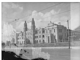
Deaf, Dumb and Blind Institute building, Darlington

Description: This is a copy of an negative taken by Sam Hood, possibly for Axtell's Ltd painters, and is part of the Home and Away Collection of the State Library of New South Wales