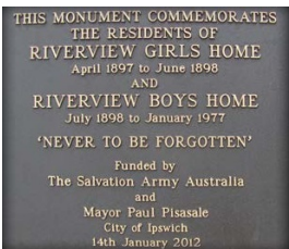
Plaque on memorial plinth at Riverview