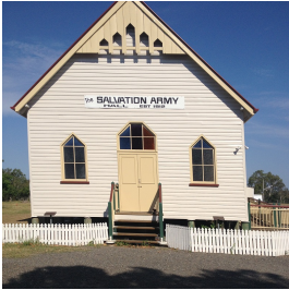
Salvation Army Hall, Riverview