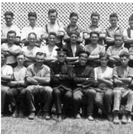
Immigrants and staff, Salvation Army Home, Riverview, October 1926