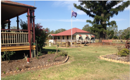
Looking towards visitor residence