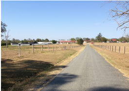
Entrance drive Riverview