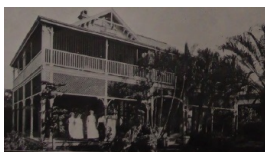
Chelmer, Qld., 1920

Description: This is an image of the Salvation Army Industrial School for Girls, Chelmer, that was published in The Week on 13 August 1920. It shows a large, two-storey house with wrap-around verandahs on the ground and first floors.