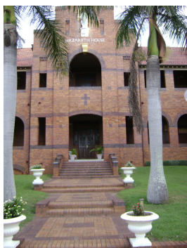
Main Entrance of Nazareth House Wynnum North