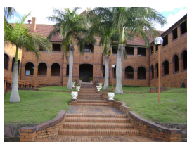
Main entrance to Nazareth House