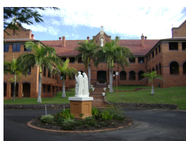
Front view of Nazareth House