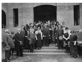
Official opening of Nazareth House, Wynnum, 1925