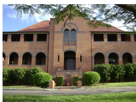
Nazareth House Wynnum North