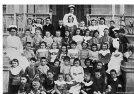
Group portrait of matron, sisters and children of the Queen Alexander Home, Coorparoo

Description: This image was copied and digitised from an image appearing in The Queenslander, 12 March, 1921, page, 19.