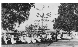
Afternoon tea in the grounds of Alexandra Home Coorparoo

Description: This image was copied and digitised from an image appearing in The Queenslander, 12 March, 1921, page, 19. The Library description states: Children dressed in uniforms and hats are singing on the verandah of Alexandra Home, Coorparoo, Brisbane, Queensland. Double pillars and decorative iron work ballustrading are visible on the front of the verandah.