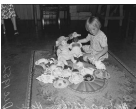
Young girl playing with her dolls, 1952 [altered from original title]

Description: This is an image of the Montrose Home for Crippled Children at Taringa. It shows a large single-storey house with enclosed front verandahs and a large double staircase leading to the front from the driveway. This image is undated, the date included is an estimate