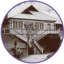
Montrose Home for Crippled Children, Taringa

Description: This is an image of the Montrose Home for Crippled Children at Taringa. It shows a large single-storey house with enclosed front verandahs and a large double staircase leading to the front from the driveway. This image is undated, the date included is an estimate