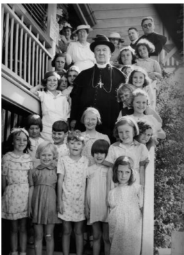
Archbishop Duhig officiating at the opening of the Catholic holiday home at Sandgate, 1940

Description: This description was supplied with the photograph and included on the library website: This home was run by the Catholic Daughters of Australia, for poor children of all denominations.