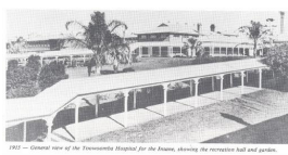
General view of hospital - 1915

Description: This photo is undated, the date included is an estimate.