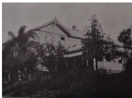
Toowong, Qld., 1914

Description: This image shows the Industrial School for Girls, Toowong.