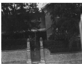
Salvation Army Home in Church Street, Toowong, 1932

Description: This library catalogue states the image was copied and digitised from an image appearing in the Sunday Truth, 28 February 1932, p. 11.