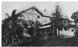
Salvation Army Home at Taringa, Brisbane, 1914