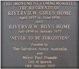
Plaque on memorial plinth at Riverview