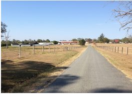
Entrance drive Riverview