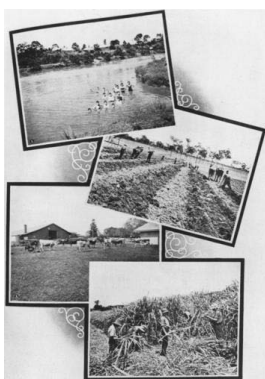
Collage of images from the Salvation Army training farm for youths, Riverview

Description: This description was supplied with the photograph and included on the library website: Images include boys having fun in a swimming hole, working on the farm with the horses, cutting crops and herding the cows.