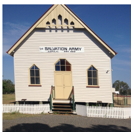
Salvation Army Hall, Riverview