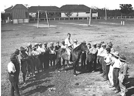
Child migration - British youth migrants learning how to mount and ride a horse at the Salvation Army Training Farm for Boys, Riverview, Queensland.

Description: This description was supplied with the photograph and included on the library website: Images include boys having fun in a swimming hole, working on the farm with the horses, cutting crops and herding the cows.