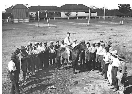
Child migration - British youth migrants learning how to mount and ride a horse at the Salvation Army Training Farm for Boys, Riverview, Queensland.

Description: This description was supplied with the photograph and included on the library website: Images include boys having fun in a swimming hole, working on the farm with the horses, cutting crops and herding the cows.