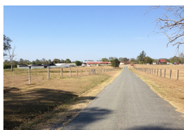
Entrance drive Riverview