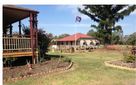
Looking towards visitor residence