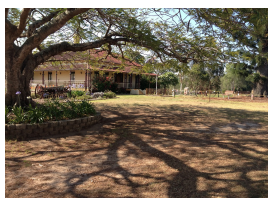
Front entrance to original home, Riverview

Description: The Salvation Army has occupied this site since 1897. The avenue of pines was planted c.1920s.