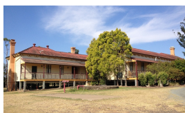
Original buildings, Riverview