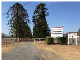
Entrance to Riverview Farm

Description: The Salvation Army has occupied this site since 1897. The avenue of pines was planted c.1920s.