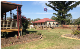
Looking towards visitor residence