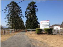
Entrance to Riverview Farm

Description: The Salvation Army has occupied this site since 1897. The avenue of pines was planted c.1920s.