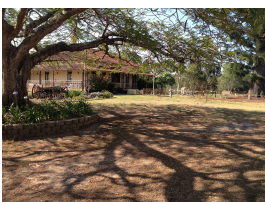
Front entrance to original home, Riverview

Description: The Salvation Army has occupied this site since 1897. The avenue of pines was planted c.1920s.