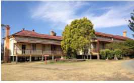
Original buildings, Riverview