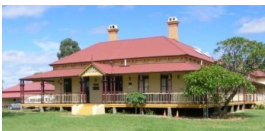
Canaan Training Room, Riverview