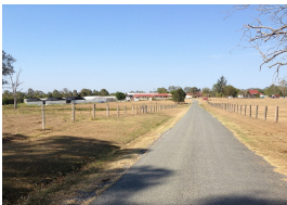
Entrance drive Riverview