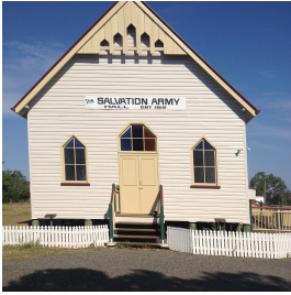
Salvation Army Hall, Riverview