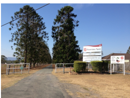
Entrance to Riverview Farm

Description: The Salvation Army has occupied this site since 1897. The avenue of pines was planted c.1920s.