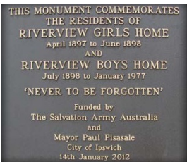
Plaque on memorial plinth at Riverview

Description: This is an image of a memorial plaque at Riverview. The inscription reads: "This monument commemorates the residents of Riverview Girls Home April 1897 to June 1898 and Riverview Boys Home July 1898 to January 1977 'Never to be forgotten' Funded by The Salvation Army Australia and Mayor Paul Pisasale City of Ipswich 14th January 2012"