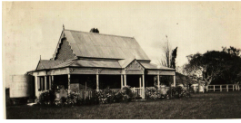
Visitors cottage, St Vincent's Orphanage

Description: This photo is undated, the date included is an estimate.