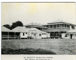
St Vincents Orphanage Girls Dormitory, Queens Road Nudgee

Description: This is a photograph of the Girls' Dormitory at the St Vincent's Orphanage, taken 1910. It shows a range of several single and double storey buildings bordering a grass field. A caption printed at the bottom of the image reads "St. Vincent's Orphanage, Nudgee. Girls' Quarters and Playground No. 1"