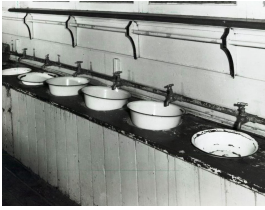
Wash room at St Vincent's Orphanage