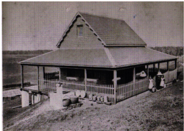
Chook House, St Vincent's Orphanage

Description: This photo is undated, the date included is an estimate.