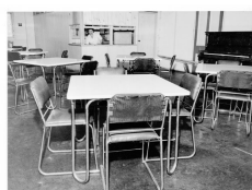
Queensland Institution for Blind, dining room, servery and kitchen, August 1952