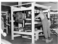
Queensland Institution for Blind, coir matting loom, August 1952