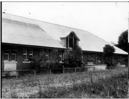
Workshop of the Queensland School for the Deaf at Dutton Park, Brisbane