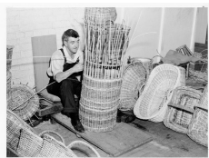
Queensland Institution for the Blind, Basket Shop, August 1952