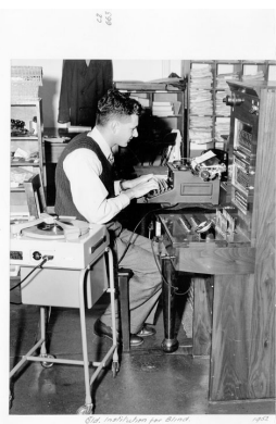
Queensland Institution for Blind, Emerdicta plastic disc recorder, August 1952