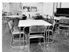
Queensland Institution for Blind, dining room, servery and kitchen, August 1952