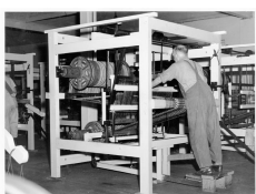
Queensland Institution for Blind, coir matting loom, August 1952