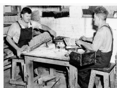
Queensland Institution for Blind, brush shop, August 1952