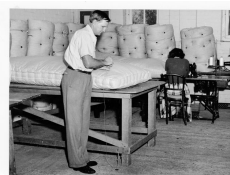
Queensland Institution for Blind, bed shop, August 1952