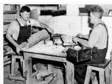
Queensland Institution for Blind, brush shop, August 1952