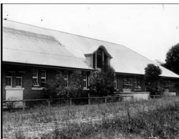
Workshop of the Queensland School for the Deaf at Dutton Park, Brisbane