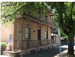
Girls Friendly Society Lodge

Description: This image is from the Property and Real Estate section of The Mail on Saturday 8 May 1915. The image shows the building that the Girls Friendly Society Lodge operated in from 1916 to 1975.